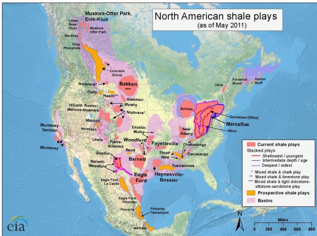
Updated: May 9, 2011

Domestic production of shale gas also has the potential over time to reduce dependence on imported oil for the United States. International shale gas production will increase the diversity of supply for other nations. Both these developments offer important national security benefits. 2